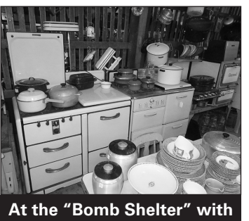
t the "Bomb Shelter" with a sample of memories